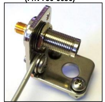
Shown with Optional Bracket (P/N 750-0656)